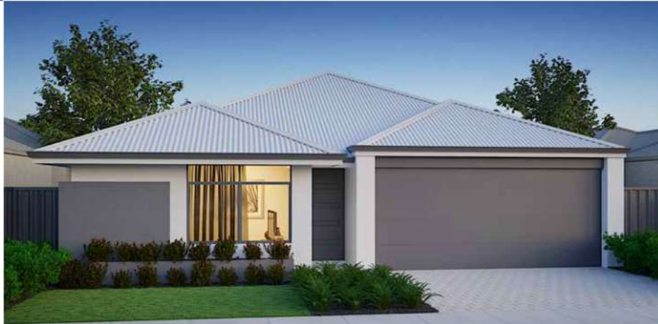
The Brighton Beach Included